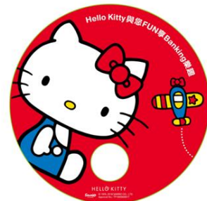
Hello Kitty Fun Banking at Dah Sing Bank – Branch decorations and free paper fan

Remark: Terms and conditions apply to the above offers. For more details, please refer to the relevant promotional material.