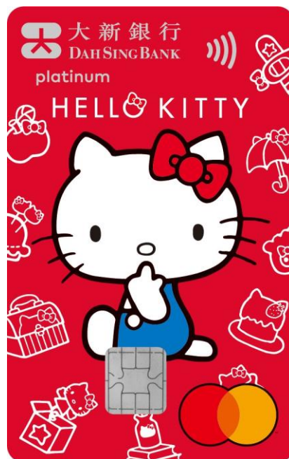
New Dah Sing Hello Kitty Credit Card

The new Dah Sing Hello Kitty Credit Card features the popular feline character in its classic 1970s style in a limited edition vertical design, which is set to become a collectible item for all Hello Kitty fans.